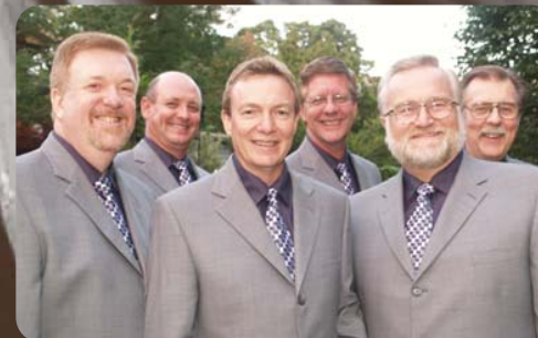
Join us for an evening with

The Grand Baccus 2155 McNicoll Avenue, Toronto (Just north of Finch between Kennedy Rd. and Midland Ave.)